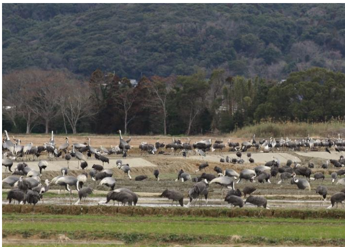
Fig. 2. Wild crane colony in Izumi City, Kagoshima, Japan. (Ryosuke Fujita, Kyushu University)