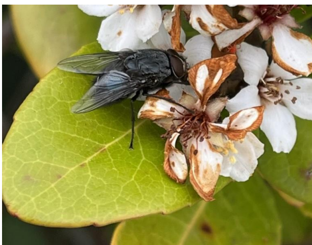
Fig. 3. The blowfly, a potential means of bird flu transmission.